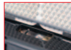
Low Oxygen Shutoff Pilot Safety System