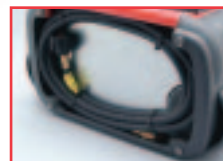
Hose Storage Bay Accommodates Up To 12 ft. Hose Assembly